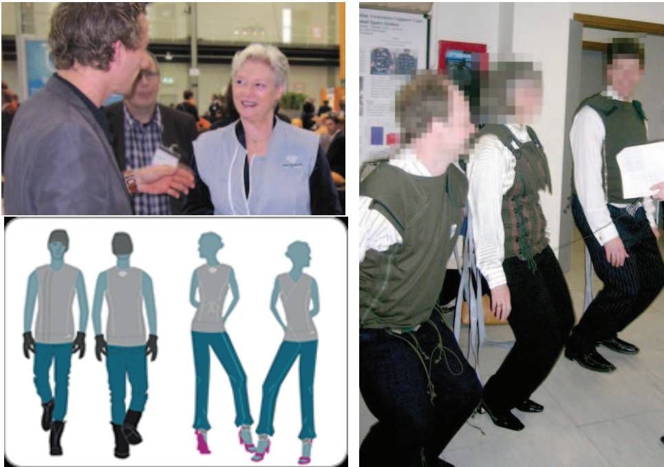
Figure 1: Dutch minister of Economic Affairs wearing a Feel The Music Suit at a public event (top-left). On the bottom left, design sketches of the suit. On the right, a demonstration of the TNO tactile dance suit showing coordinated dance movements by three users.

A good example of innovative audio content with well-being application is Meditainment [19] (= Meditation + Entertainment), which combines relaxing music, ambient soundscapes, nature sounds, voice coaching and guided meditation and visualisation techniques. One particular use of this content which is reportedly being investigated is pain management for hospital patients. Typically, the audio content in existing products such as Meditainment is static, id est not interacting with the user nor automatically adapting to the user. One of our hypotheses is that making this content more adaptive to the user could make audio stimulation much more effective and attractive.